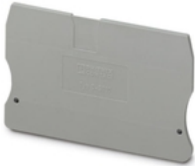
End cover, length: 71.5 mm, width: 2.2 mm, height: 49.9 mm, color: gray

Please be informed that the data shown in this PDF Document is generated from our Online Catalog. Please find the complete data in the user's documentation. Our General Terms of Use for Downloads are valid ( http://phoenixcontact.com/download )